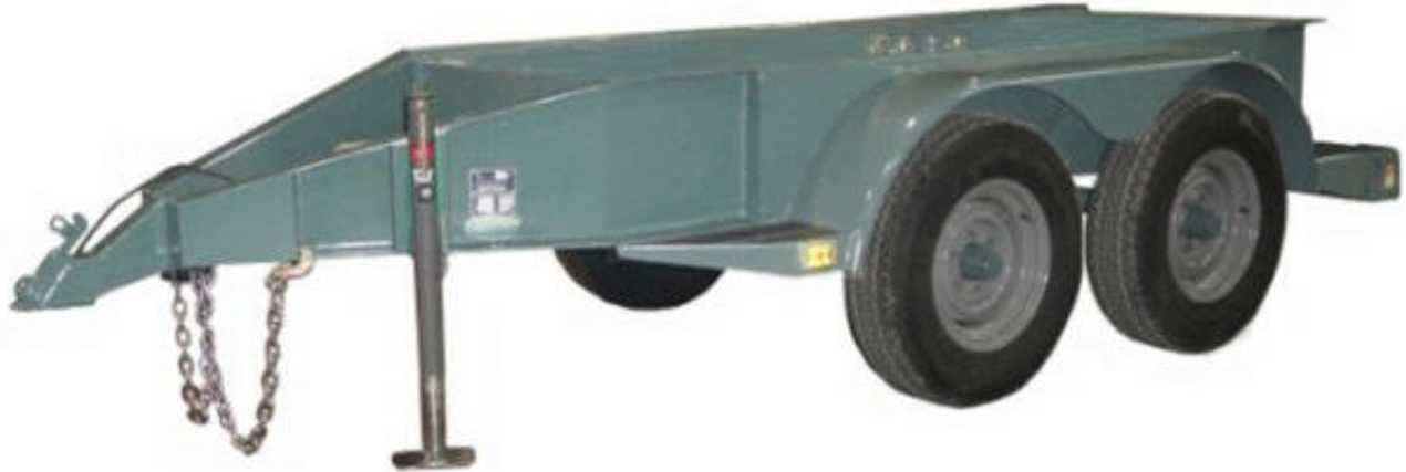
An 8000 GVW Tandem Trailer, Model Number PTT8000, With A 150 Gallon Sub-Base Tank.

When portability is essential, Pryco tank/trailers is a must. The tank, a sub-base tank (sold separately), is integrated into the design of the trailer. The actual design centers around the make and model of the gen-set and required total gross vehicle weight (GVW).